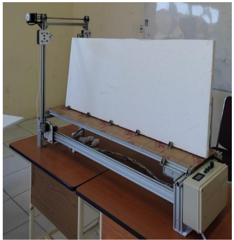
Fig. 1 CNC2 Axis Based Styrofoam Cutting Machine Using Hot Wire.

Research in the process of making this machine uses experimental methods, including the design process, the manufacturing and assembly process and the testing process, the styrofoam cutting machine can be seen in Fig. 1 .